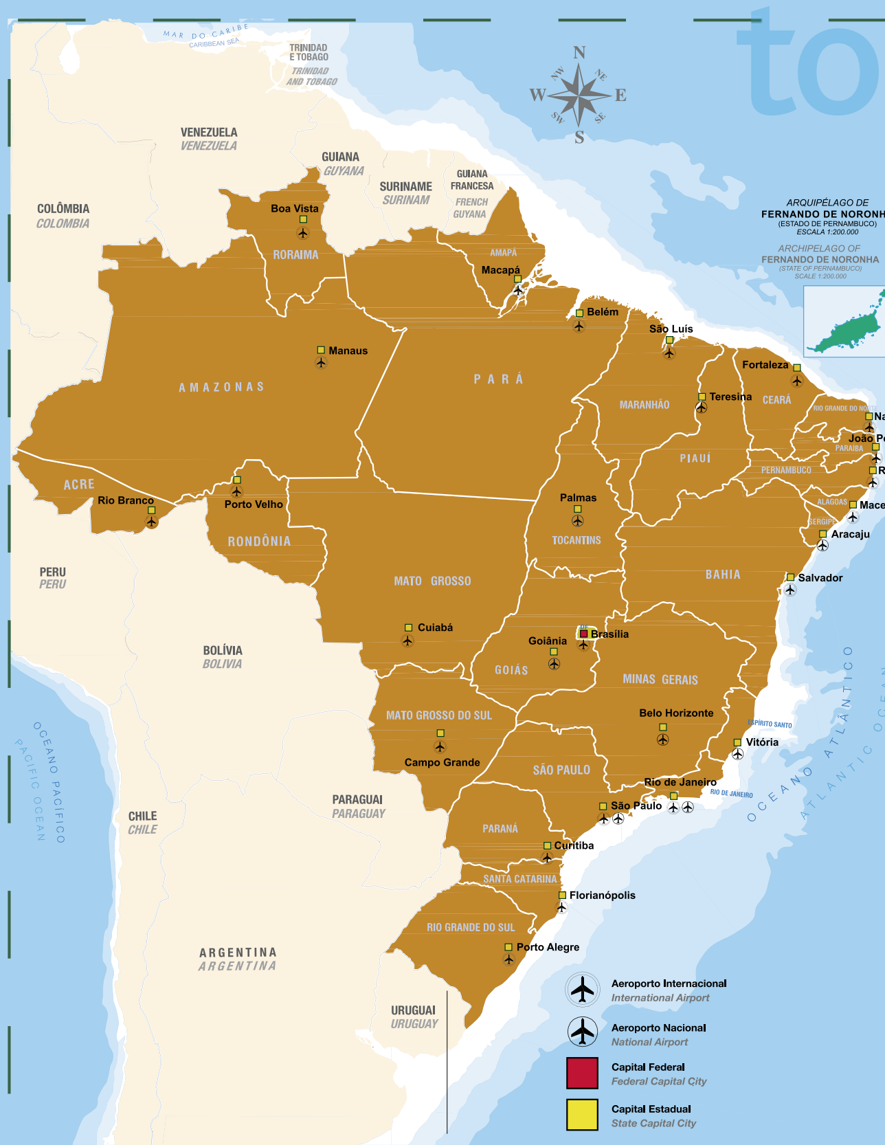
Mapa Mundi/World Map